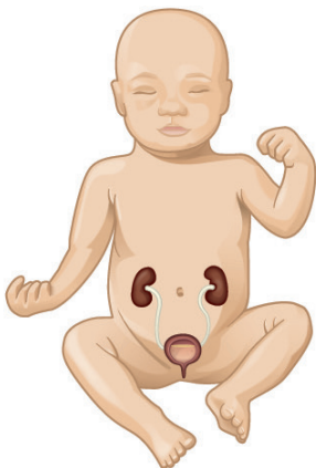
Baby With A Healthy Urinary Tract and Kidneys

After diagnosing LUTO, our team assesses the severity of the obstruction. Mild cases may only require observation during pregnancy and further evaluation after birth. In severe cases, however, fetal surgery may be the best option.