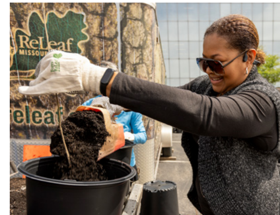
Photo - Earth Day tree planting at Mission Hill

SSM Health is a member of the national Healthcare Anchor Network and the St. Louis Anchor Action Network, which focus on improving community health and well-being.